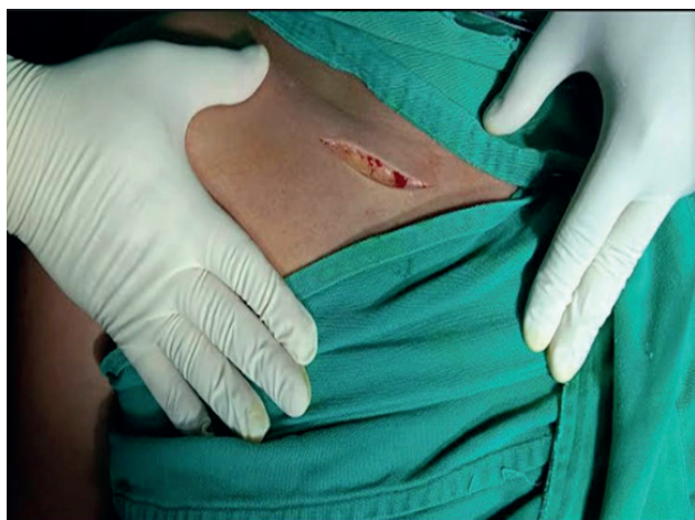
Figure 2. Longitudinal incision from the medial edge of the sternum to the middle third of it, approximately 10 centimeters.